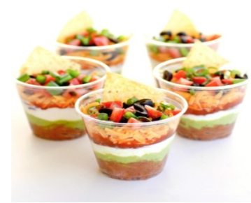
Individual Seven-Layer Dips