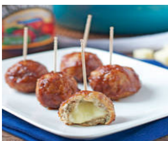
Cheese Stuffed Apple Chicken Meatballs