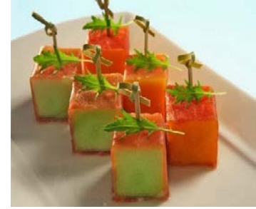
Prosciutto And Melon Bites