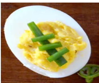
Football Deviled Eggs