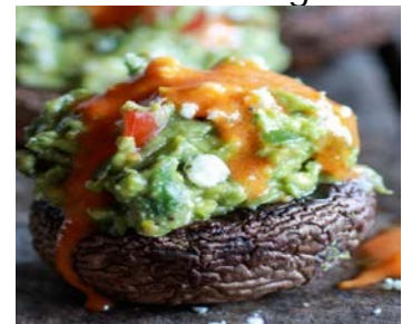
Blue Cheese Guacamole Stuffed Mushrooms