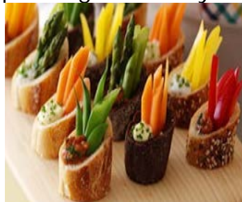
Cut a baguette Cubs with veggies and pesto