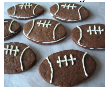
Super Bowl Cookies