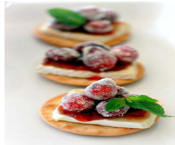
Sparkling Cranberry Brie