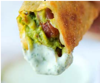
Avocado Egg Rolls