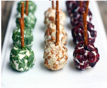
Mini Cheese Ball Bites