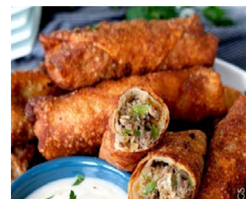
Cheese steak Egg Rolls