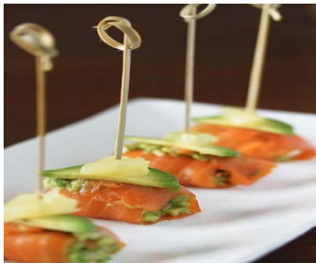
Smoked Salmon Bites