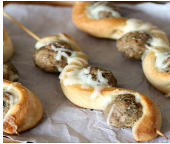
Meatball Sub on a Stick