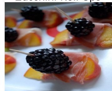
Apricot Prosciutto and Blackberry Bites