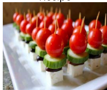
Tomato, Feta, Cucumber and olives