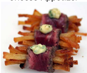
Steak & Fries with Béarnaise Sauce