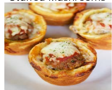
Meatball Sub Cupcakes