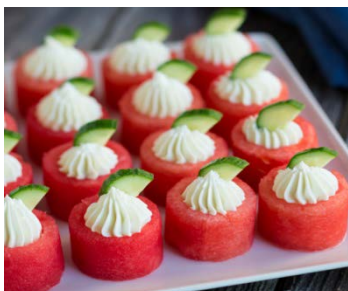
Watermelon and Goat Cheese Appetizer