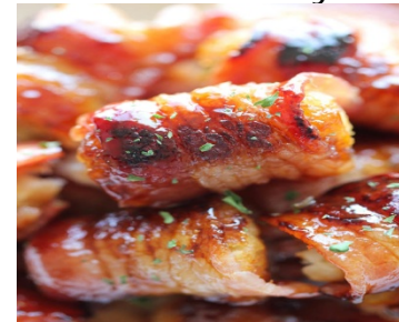
Bacon Tater Tot Bombs