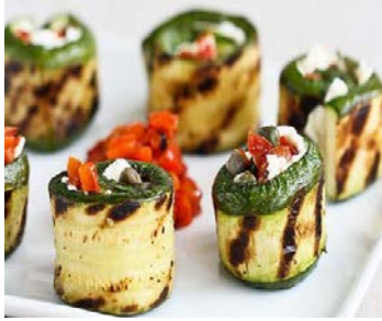
Rollatini grilled zucchini, goat cheese, peppers and capers