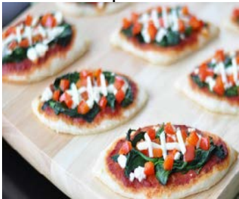
Football Spinach Pizzas