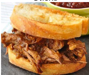
Apple Barbecue Pulled Pork