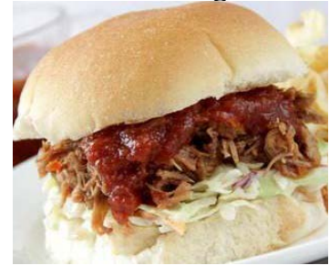
Sweet & Spicy Root Beer BBQ Beef