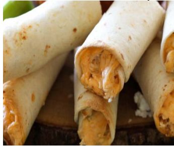
Buffalo Chicken Taquitos