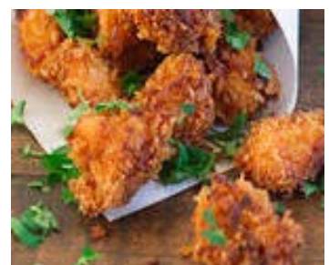
Chipotle Popcorn Chicken