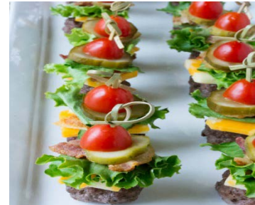
Mini Bun-less Cheeseburger