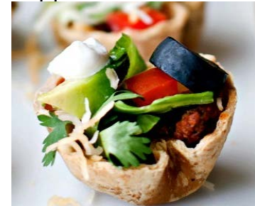
Taco Salad Mini Bites