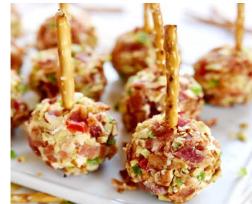
Pimento Cheese & Bacon Mini Cheese Ball Bites