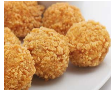
Buffalo Chicken Cheese Balls