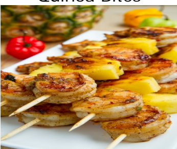
Grilled Jerk Shrimp and Pineapple Skewers