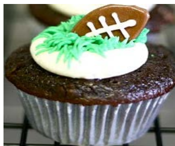
Super bowl Cupcakes