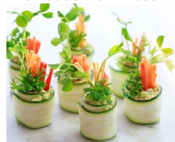
Vegan Friendly Canapés: Zucchini Roll Ups