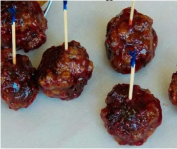
Raspberry Chipotle Meatballs