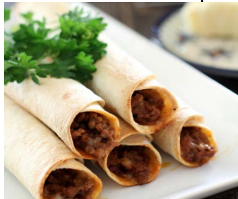
Baked BBQ Beef Taquitos