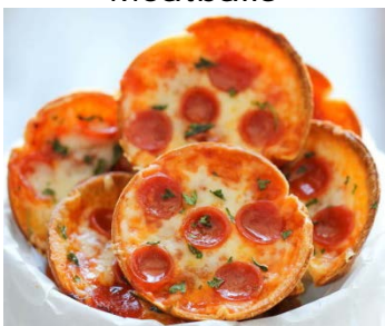
Mini Deep Dish Pizzas