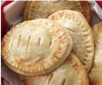
Football Fest Empanadas