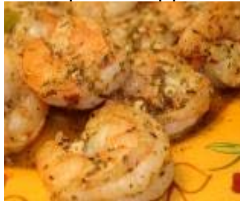
Shrimp in Butter-Ber Sauce