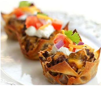
Beef Taco Cups

All prices are per guest/Minimum order: 10 Guests