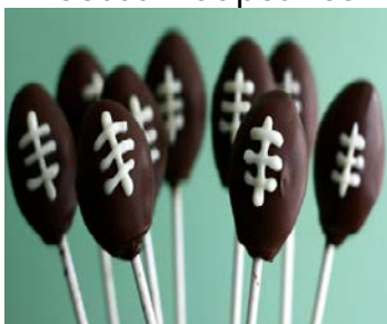
football cake pops