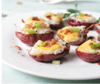
Loaded Baked Potato Bites