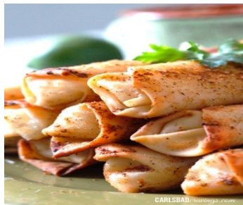
Chili Lime Nacho Mozzarella Sticks