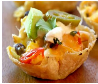
Chicken Taco Cups