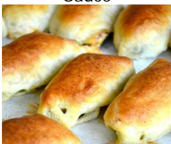
Pastry Jalapeno Poppers