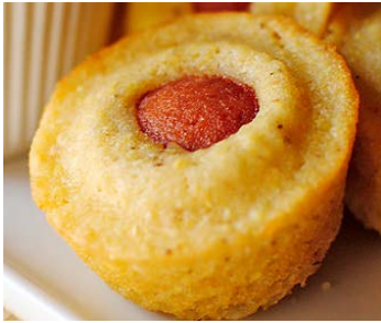
Mini Corn Dog Muffins