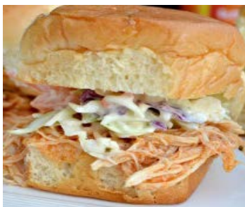
Shredded Buffalo Chicken