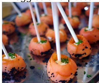
Smoked Salmon Lollipop Recipe