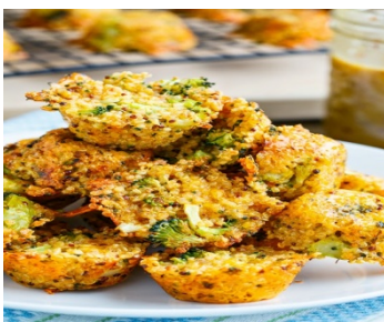
Broccoli and Cheddar Quinoa Bites