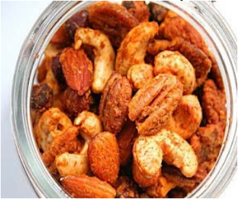
Buffalo Spiced Nuts