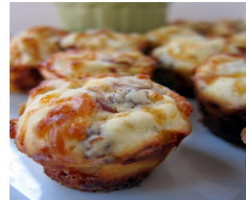
Pepperoni Pizza Puffs